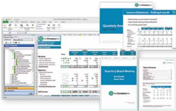
Dynamic Excel Reports Intelligently Linked to Adaptive